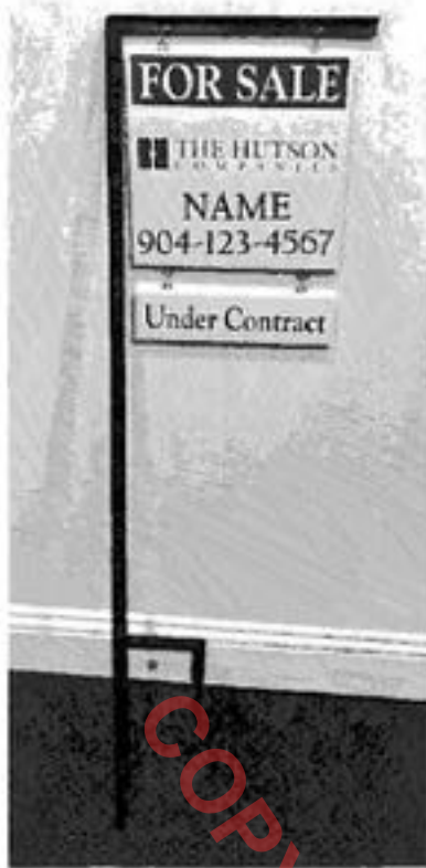
Exhibit C For Sale Signs

Sign stands shall be made of aluminium or wrought iron and shall have dimensions of approximately 48" by 14".